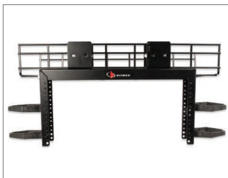
Parallel to Tray (Flush)