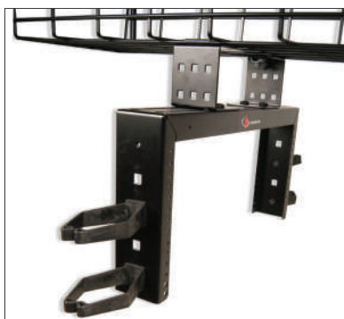
Perpendicular to Tray (Below)