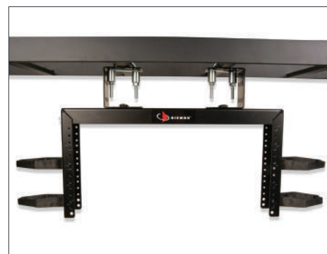
Perpendicular to Ladder Rack (Below)

Because we continuously improve our products, Siemon reserves the right to change specifications and availability without prior notice.